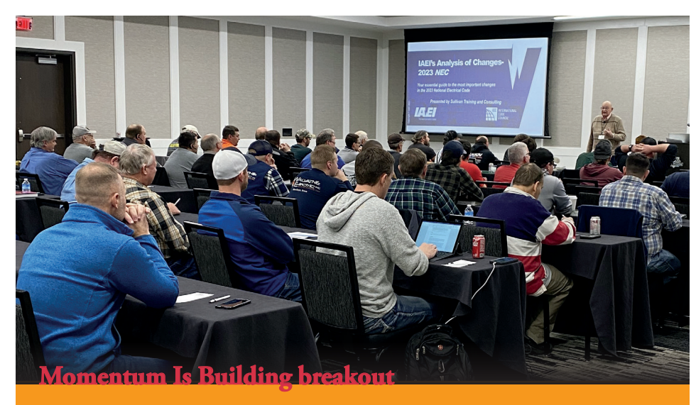
Above | Momentum is Building 2024 is scheduled for Feb. 8 and 9 at the Meadows Events and Conference Center in Altoona. Registration is open at www.momentumisbuilding.com

and cost-effective home comfort solutions."