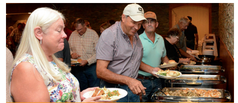
Above | RVEC annual meeting Sept. 6.