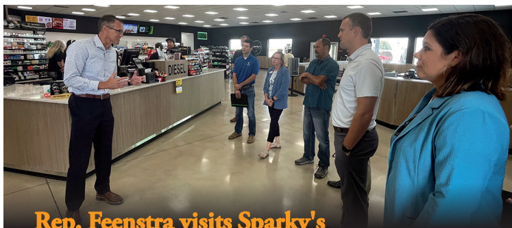
Rep. Feenstra visits Sparky's

Corn Belt Power and Calhoun County Electric Cooperative Association were on hand Tuesday, Aug. 29 to meet with U.S. Rep. Randy Feenstra at Sparky's, near the newly formed Calhoun County Business Park, Rockwell City. The group discussed economic development, rural power reliability and other issues during the hour-long meeting.