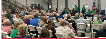
Above | Grundy County REC annual meeting