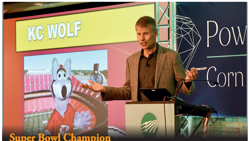
Super Bowl Champion