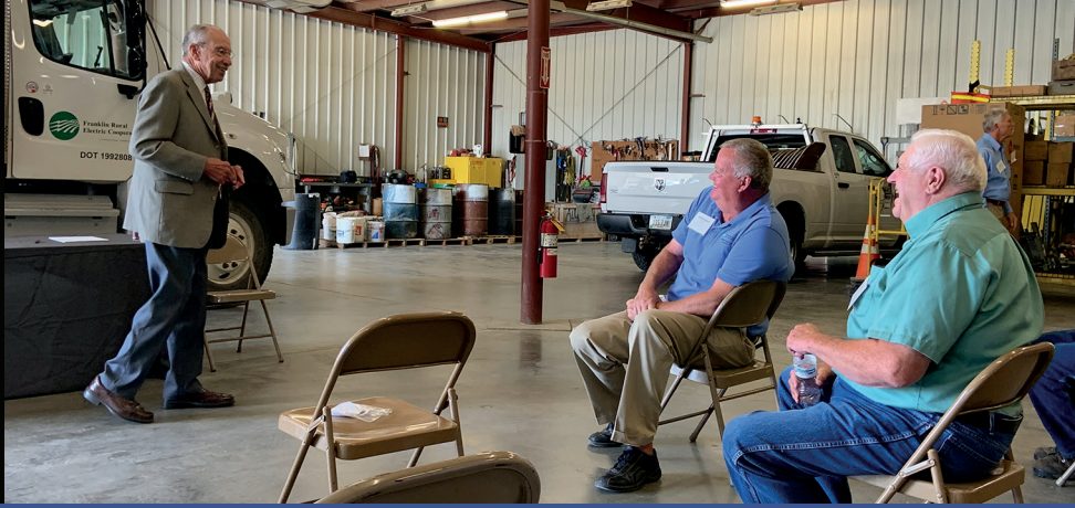
Above | U.S. Sen. Charles Grassley visits with cooperative employees and directors at Franklin Rural Electric Cooperative on Monday, August 31. Grassley made the stop in Hampton as part of his yearly 99 county tour.